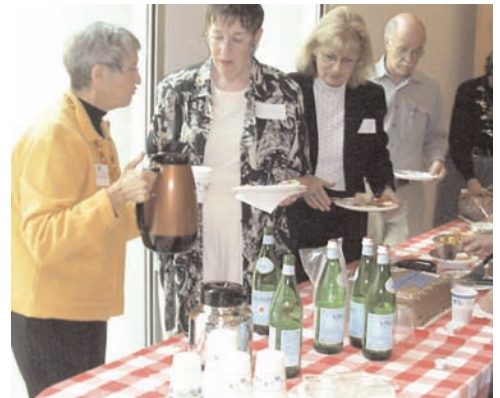
Scenes from last year's general meeting.